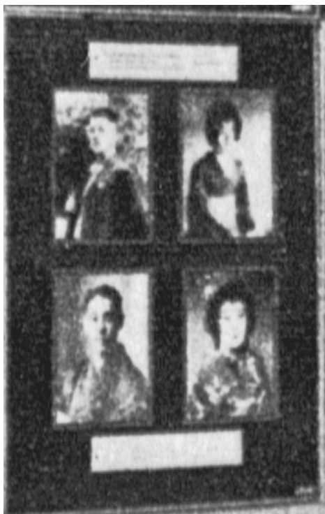
Figure 2: Quadruple tableau of Japanese female impersonators from the Wall of Sexual Transitions