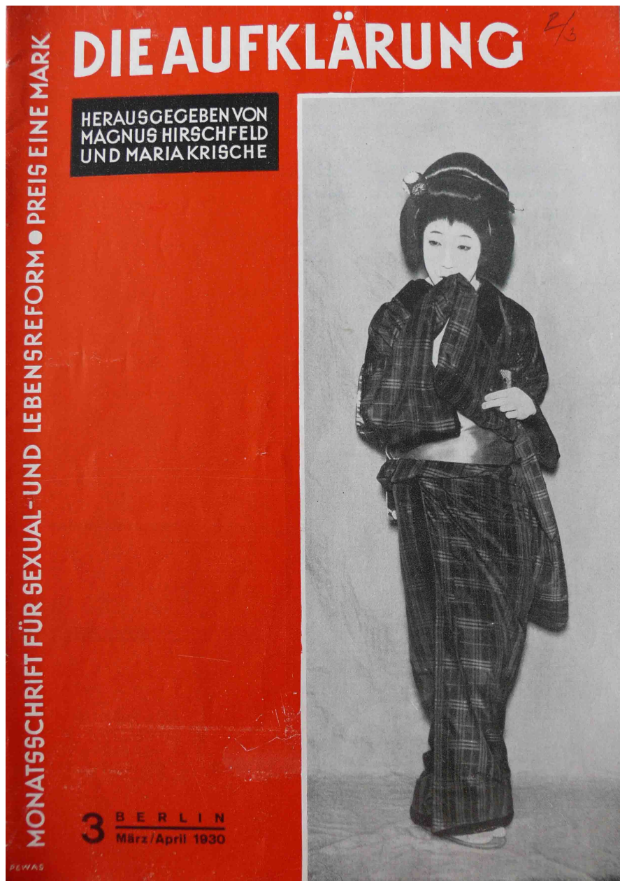
Figure 4: Hirschfeld's Female Impersonators Die Aufklärung (1930)