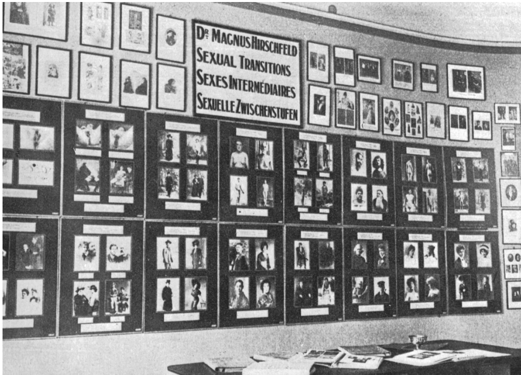
Figure 1: Wall of Sexual Transitions