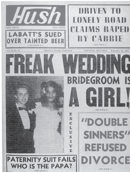
Figure 1. Toronto tabloid Hush provided regular coverage of goings-on among local butch and femme lesbians, including this wedding ceremony. Hush , February 23, 1957, 1.